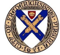
City of Fredericksburg